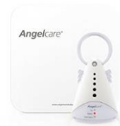
AC 300 Movement Monitor