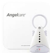
AC 300 Movement Monitor