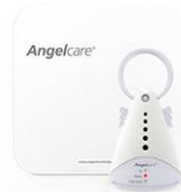
AC 300 Movement Monitor