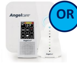
AC 701 Sound and Movement Monitor