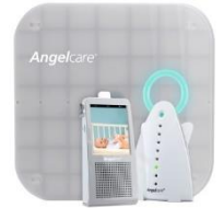
AC 1100 Video, Sound and Movement Monitor