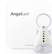
AC 300 Movement Monitor