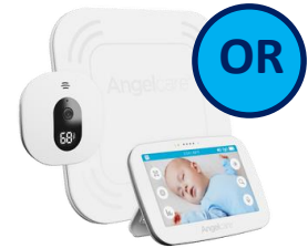
Video, Sound and Movement Monitor