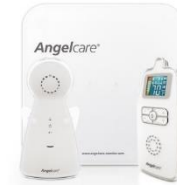
AC 403 Sound and Movement Monitor