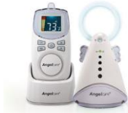
AC 420 Sound Monitor