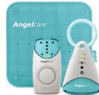
AC 601 Sound and Movement Monitor