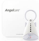
AC 300 Movement Monitor